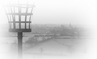
Beacon and Crick village from Cracks Hill