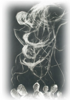
Image: from Charcoal Gospel by Neil Thorogood © Neil Thorogood/United Reformed Church 2016.

(Meditation: from Charcoal Gospel by Neil Thorogood © Neil Thorogood/United Reformed Church 2016.)